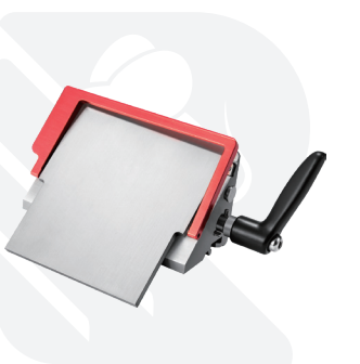
Blade holder upper bracket $700-F9