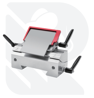
Blade holder assembly S700-F7