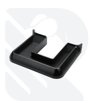
Easy-clean waste tray S700-F5