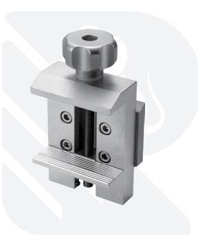
Standard clamp S700-F4