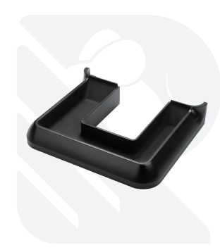
Antistatic waste tray S700-F6