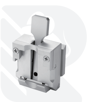
Universal clamp S700-F3