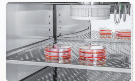
② High efficiency filtration system