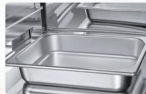
① Stainless steel liner& water pond